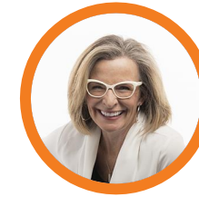
Vaccine Administrator / VA Assistant